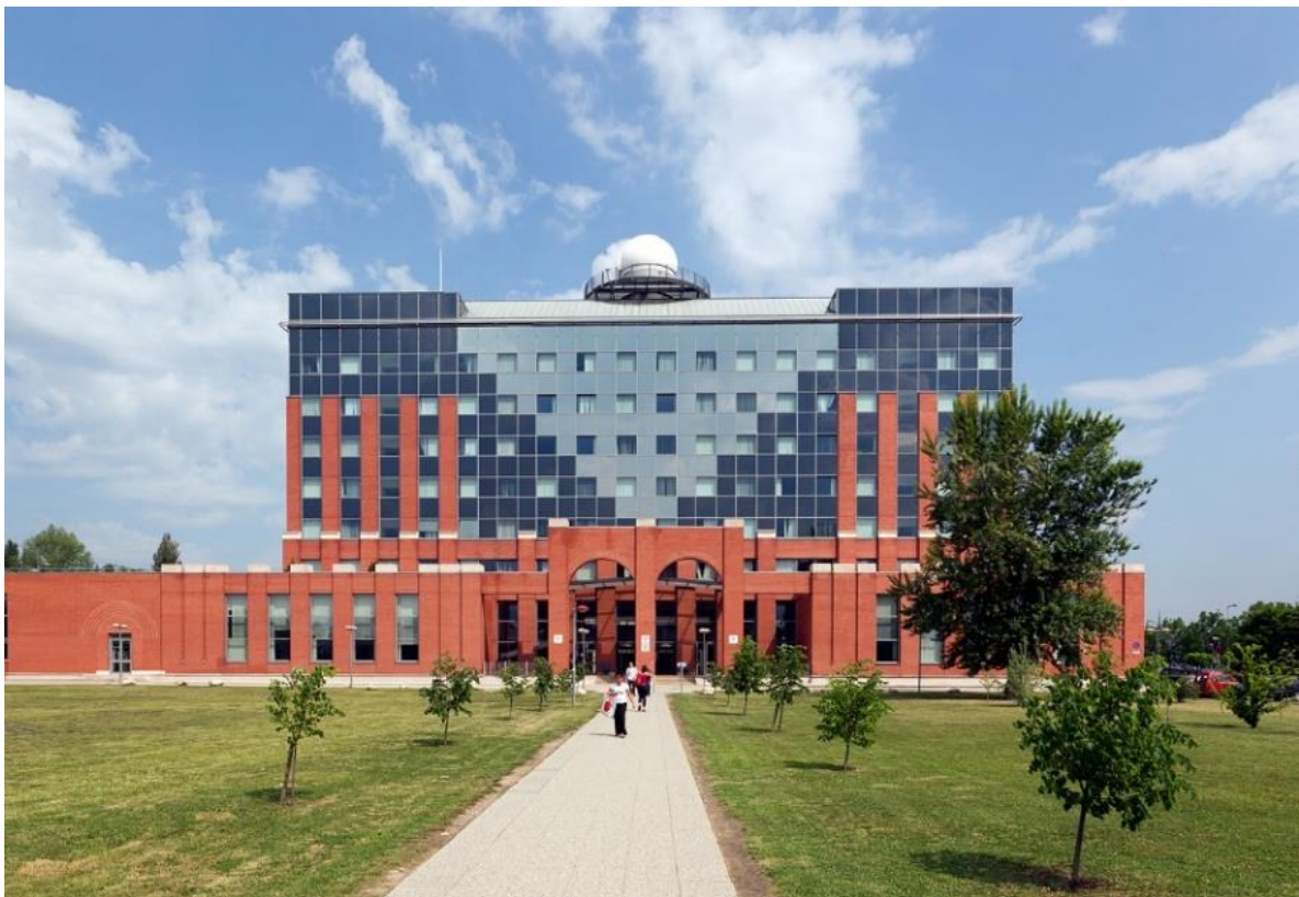
1/A Pázmány Péter sétány (North Building) (Entrance from 1/C Pázmány Péter sétány)

Venue: 1/A Pázmány Péter sétány (North Building), 1117 Budapest. 7.21 (Floor 7, Room 21) (Faculty Council Room)