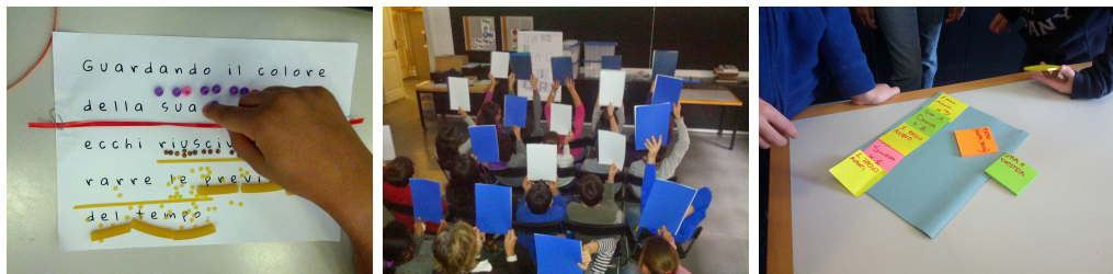
Figure 1: Pictures taken during the workshops: Wikipasta, Human Pixels, and Mazes.

automation Which manipulations can be performed by a mechanical interpreter? How can this be done?